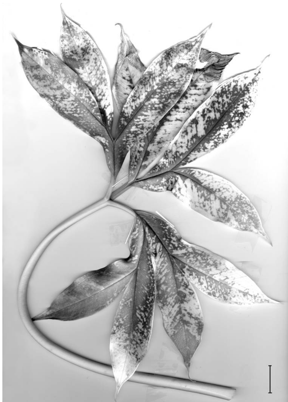
Fig. 2. Amorphophallus mangelsdorffii – Leaf from a cultivated plant originating from the locus typicus. – Scale bar = 2 cm; photograph by R. Mangelsdorff.